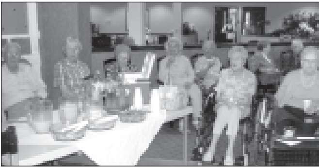
We always have a great turn out for Know Your neighbor