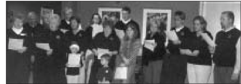
Christmas carolers from First State Bank.

Shalimar Gardens saw a record number of Christmas carolers and other entertainers during the holiday season. We really enjoyed and appreciated their time and talents. Here are just a few pictures.